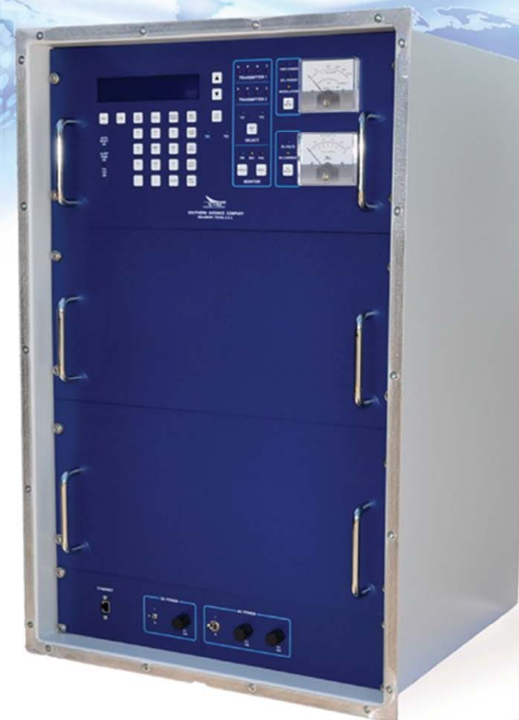
SE Outdoor IP66 Cabinet

Local Control Panel Remote Ethernet access Antenna Coupler Antennas Dummy Load Dummy Antenna Test Equipment