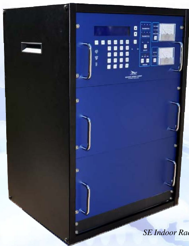
SE Indoor Rack Cabinet

Due to our 47 years of experience, superior quality products, and commitment to long-term customer satisfaction, Southern Avionics is recognized as one of the foremost manufacturers of NDB equipment in the world.